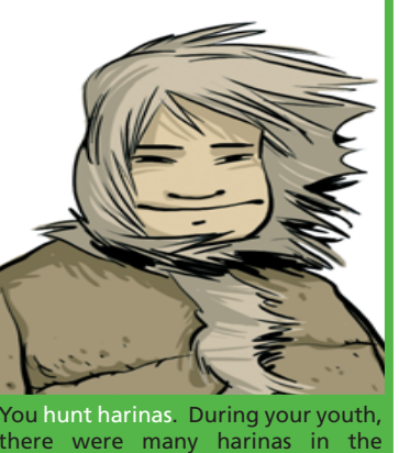
waters of Nora-Bama. For the past few years, the numbers have been diminishing due to climactic changes.