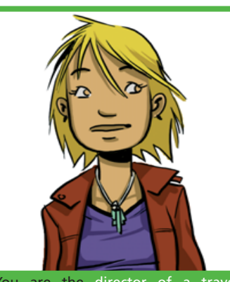
You are the director of a trave agency that organises trips in the world's most remote areas (virgin forests, Polar Regions) and would like to build a hotel in Nora-Bama.