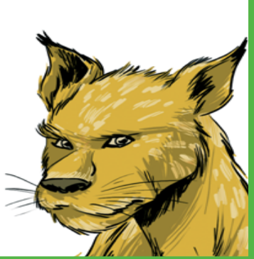
You are a gleopard. Several years ago, your territory expanded as far as the eye could see and beyond and your population was high in numbers. Since 80% of the tropical forest, your home, has disappeared, you are now in danger of becoming extinct.