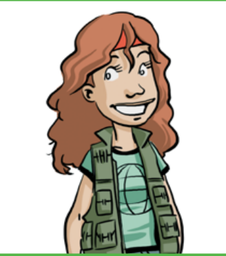
You are an ecologist and part of a non-governmental organisation working towards environmental protection of the region.