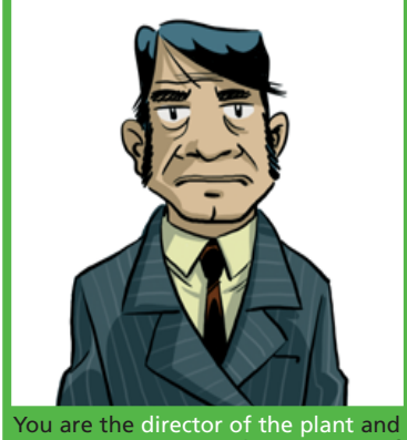
want to increase the export of furniture overseas. By changing a part of the natural reserve, and exploiting new plantations, it will be possible to cut down even more trees n the future.