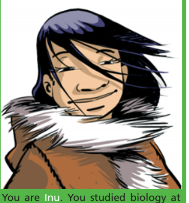
You are Inu. You studied biology at the University of Torombo and specialised in biodiversity. Your work Nora-Bama is to determine the nfluence of global warming on the ora and the fauna.