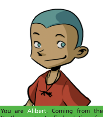
North, you try to find solutions for Tobolo while also being active in your own country.