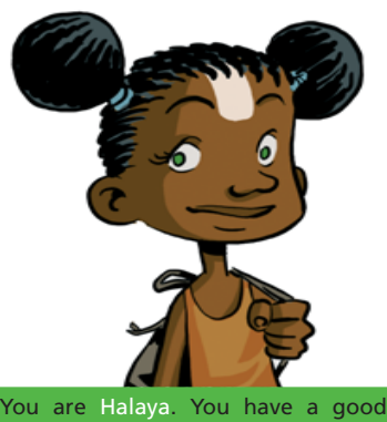
understanding of the problems concerning your region and the creation of natural reserves.