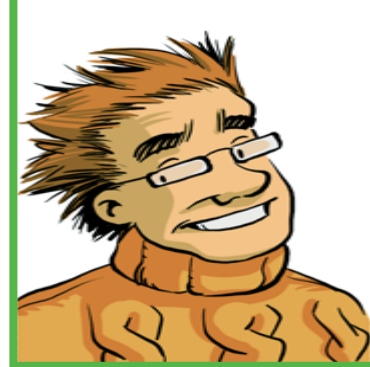
You are Archill, a scientist having spent many years studying the climate. Optimistic by nature, you try o promote all activities aimed at educing man's impact on the planet.