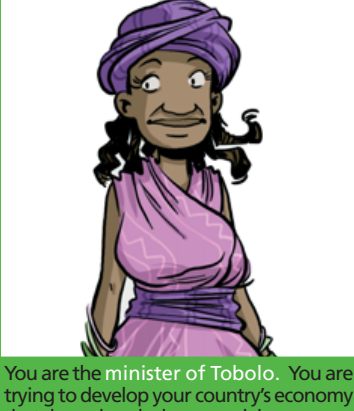
that has already borrowed large sums from northern countries to build a telecommunications infrastructure and put together an army for protection against neighbouring countries.