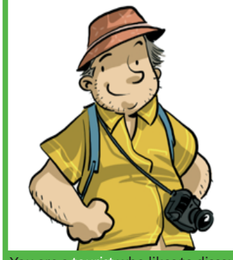
You are a tourist who likes to discover places off the beaten path. You want to photograph wild animals in their own habitat and are willing to do anything to bring back typical souvenirs and trophies (gleopard