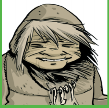
You are an old woman from Nora-Bama. Much has changed since your childhood: the climate has varmed; a village, airport and science station were built: plant and animal pecies have gone extinct.